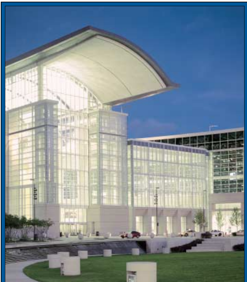
Chicago's McCormick Place will be home this week to the American College of Cardiology 52nd Annual Scientific Session and Exposition.