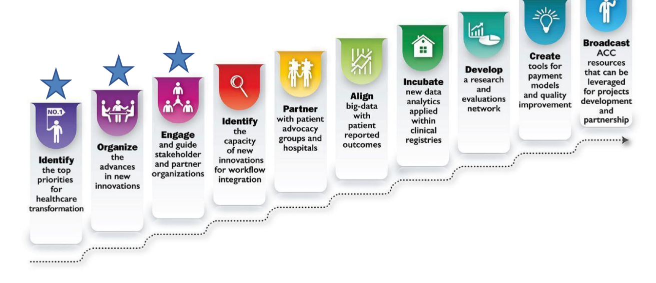
Figure 1: Taking the First Step.